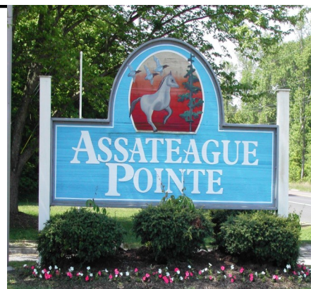
Front Sign to our community.