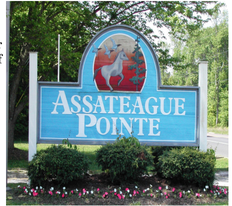
ASSATEAGUE POINTE FRONT SIGN THE PLACE TO BE IN O.C.