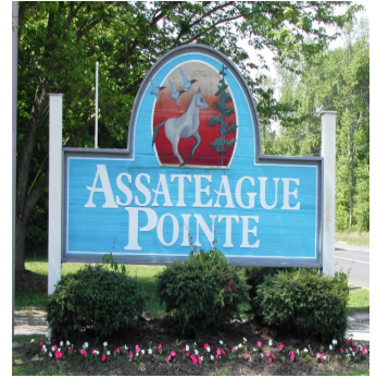
The Place to Be in O.C.