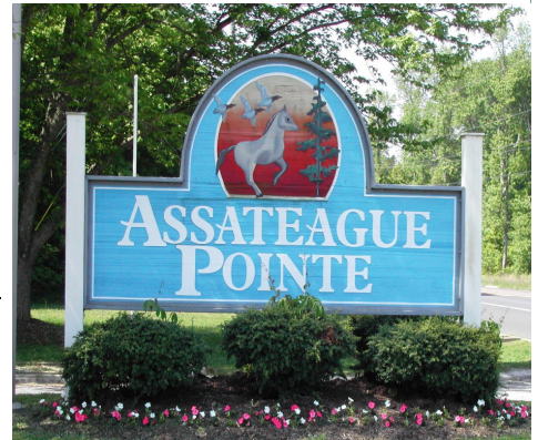
Sign to Entrance to Assateague Pointe