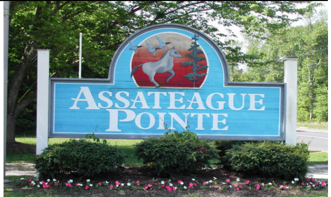
Assateague Pointe The place to be in O.C.

The Board of Directors would like to invite you to our next Board Meeting being held at the Worcester county Prep School on July 9, 2011 at 9:00 AM. This is our Annual meeting where we elect board members for the upcoming year, go over the budget and the status of the community. If you can not make this meeting, you can sign a proxy for someone to vote for you. The proxy's can be signed and dropped at the front office. The