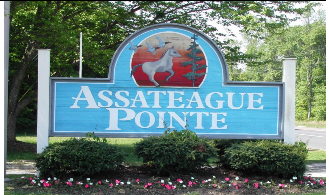
Assateague Pointe The place to be in O.C.

The Board of Directors would like to invite you to our next Board Meeting being held at the Worcester county Prep School on July 14,2012 at 9:00 AM. This is our Annual meeting where we elect board members for the upcoming year, go over the budget and the status of the community. If you can not make this meeting, you can sign a proxy for someone to vote for you. The proxy's are located in the front office. The proxy's can be signed