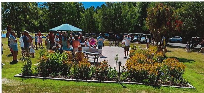
Pictured left, the Butterfly Release at McGee Park on August 13th.