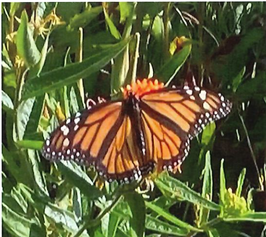
Pictured left, a monarch visiting our butterfly garden at McGee park.