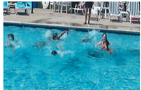
Children's Pool Party