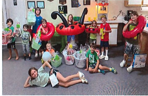
Children's Movie Night