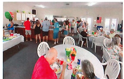
Farewell to Summer