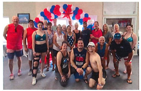
4th of July Picnic